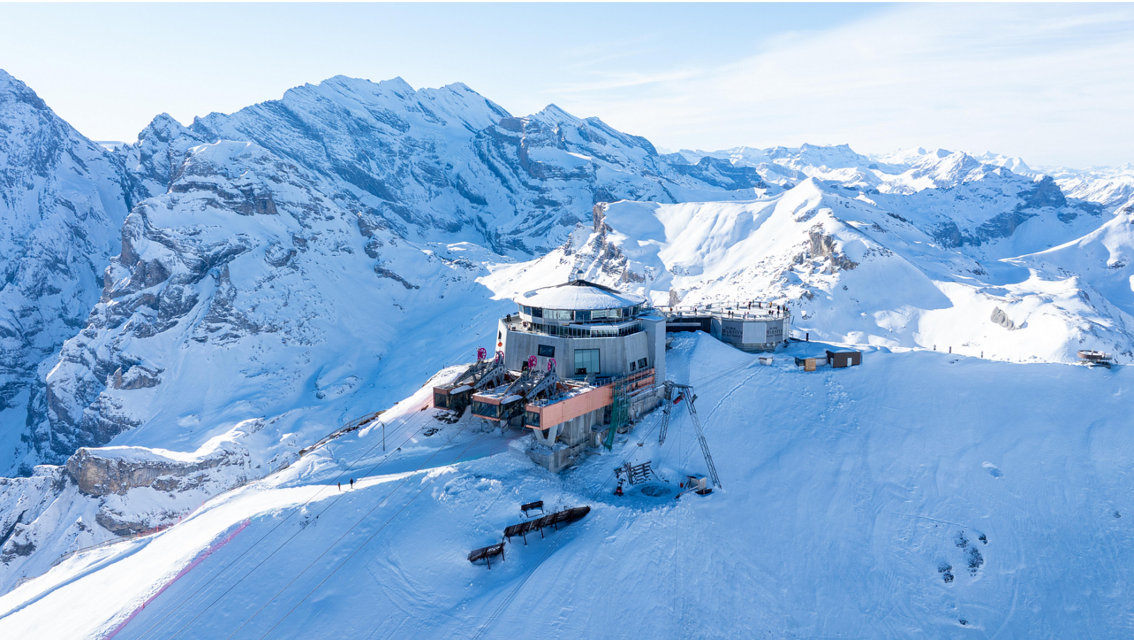
The Schilthorn - Piz Gloria in December 2025, after the crane was dismantled