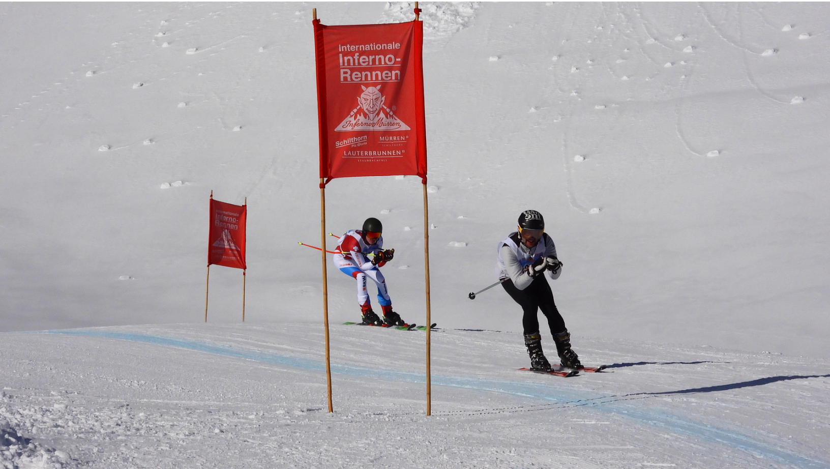
Two competitors at the 78th Inferno downhill race