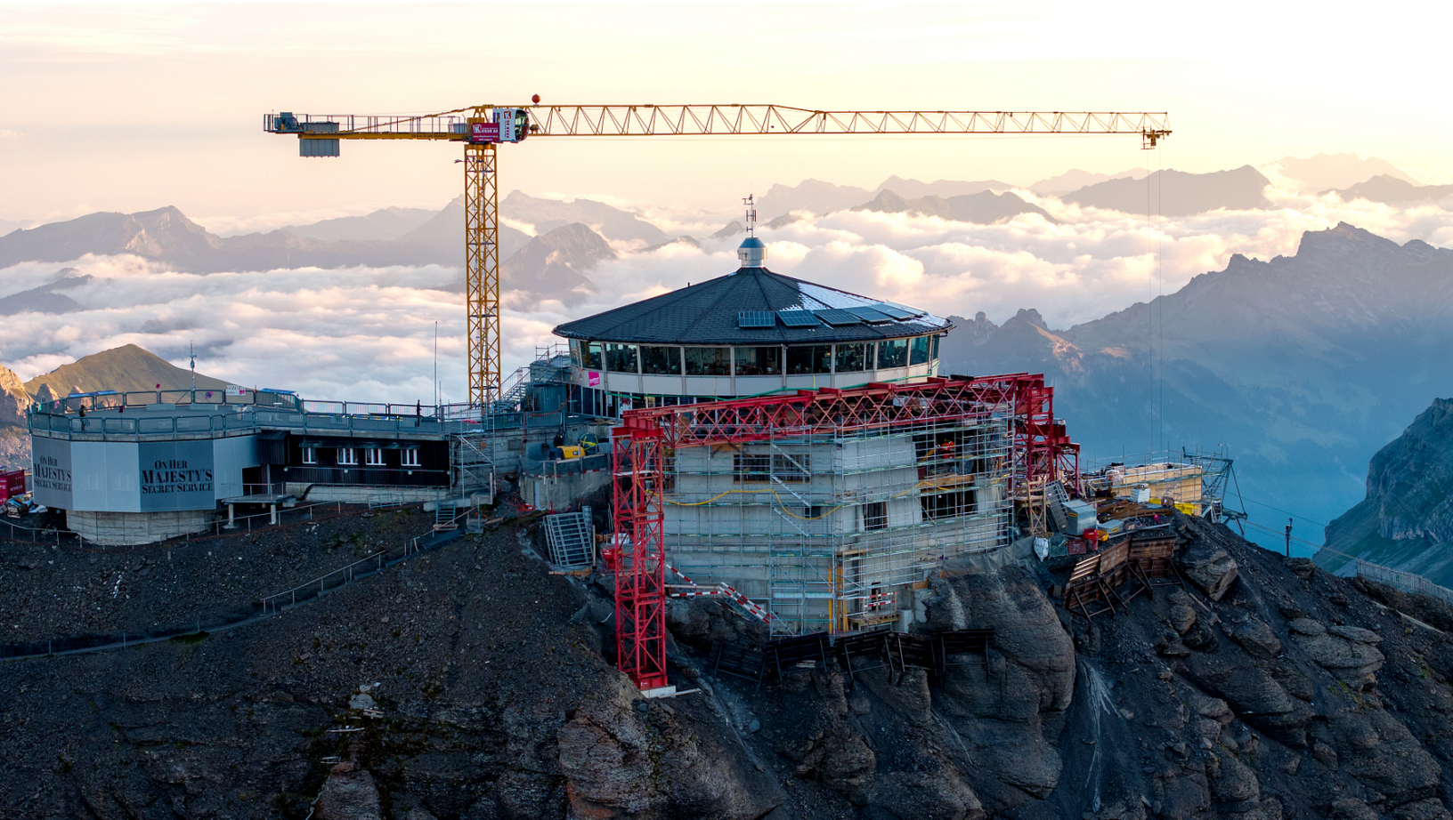
Picture of the Schilthorn summit on 17 October 2024, shortly after the cable car from Birg was discontinued.