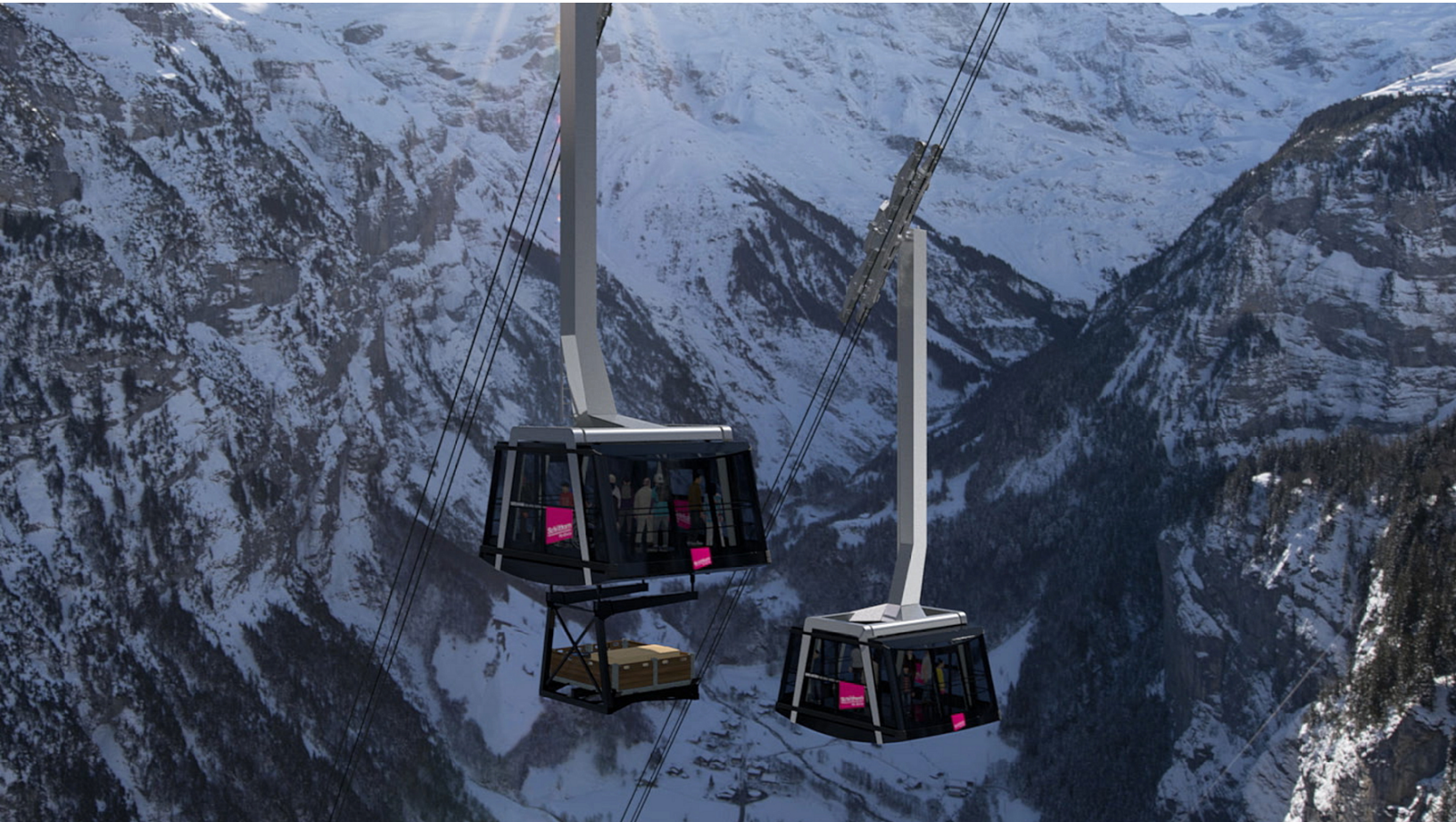
Visualisation of the new aerial cableway between Stechelberg and Mürren